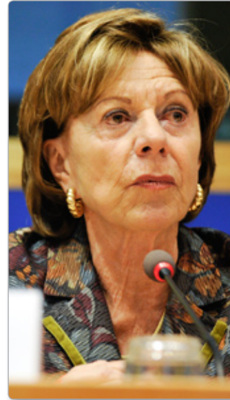
▼ Neelie Kroes European Commissioner for Digital Agenda, European Commission

Delegates included representatives from: Alcatel-Lucent, Analysys Mason, Belgacom, Cable Europe, Cullen International, Digital Europe, eBay, Ericsson, ESOA, European Commission, Eutelsat, GSMA Europe, Intel, Nokia Siemens Networks, OFCOM, Orange France Telecom Group, Thomson Reuters, US Mission to the EU, Verizon, Vodafone Group, Yahoo!