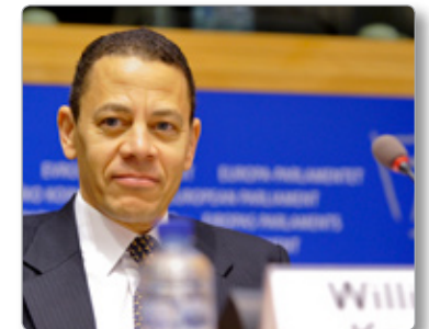
▲ William E. Kennard US Ambassador to the EU US Mission to the EU