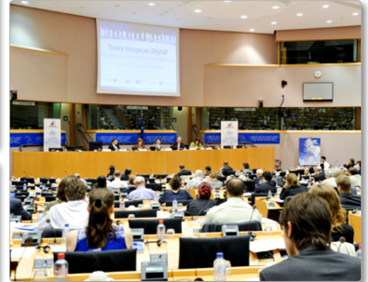
▼ Inside the European Parliament