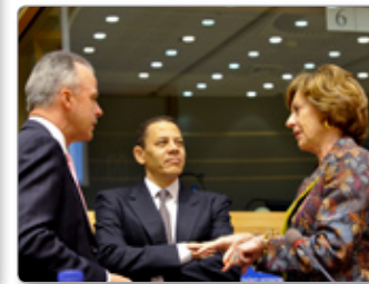
▲ William E. Kennard, Neelie Kroes & Brendan Nelson discuss the conference issues.